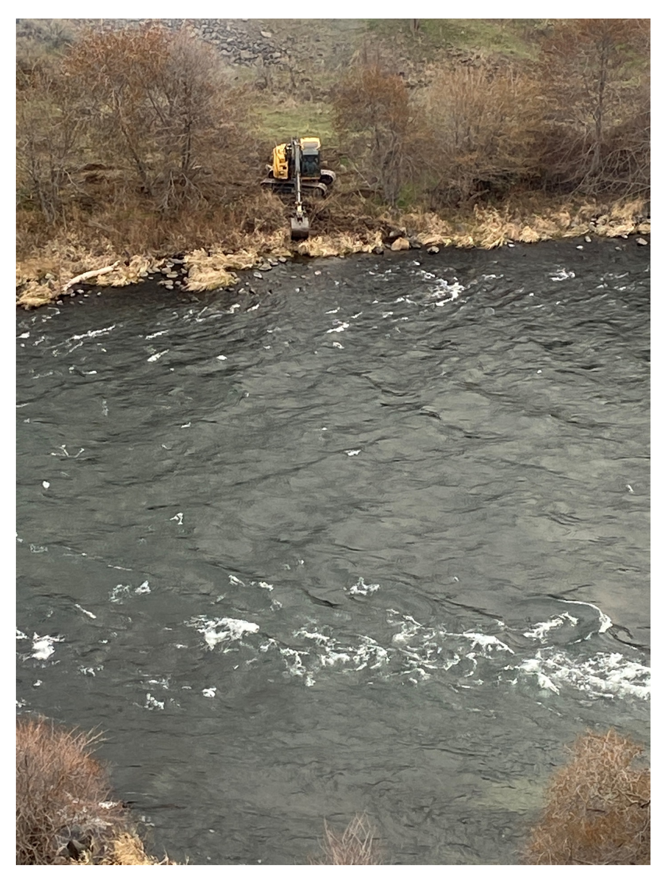
Figure 4 Feb 2022 Excavator Pulling Vegetation/Trees from River