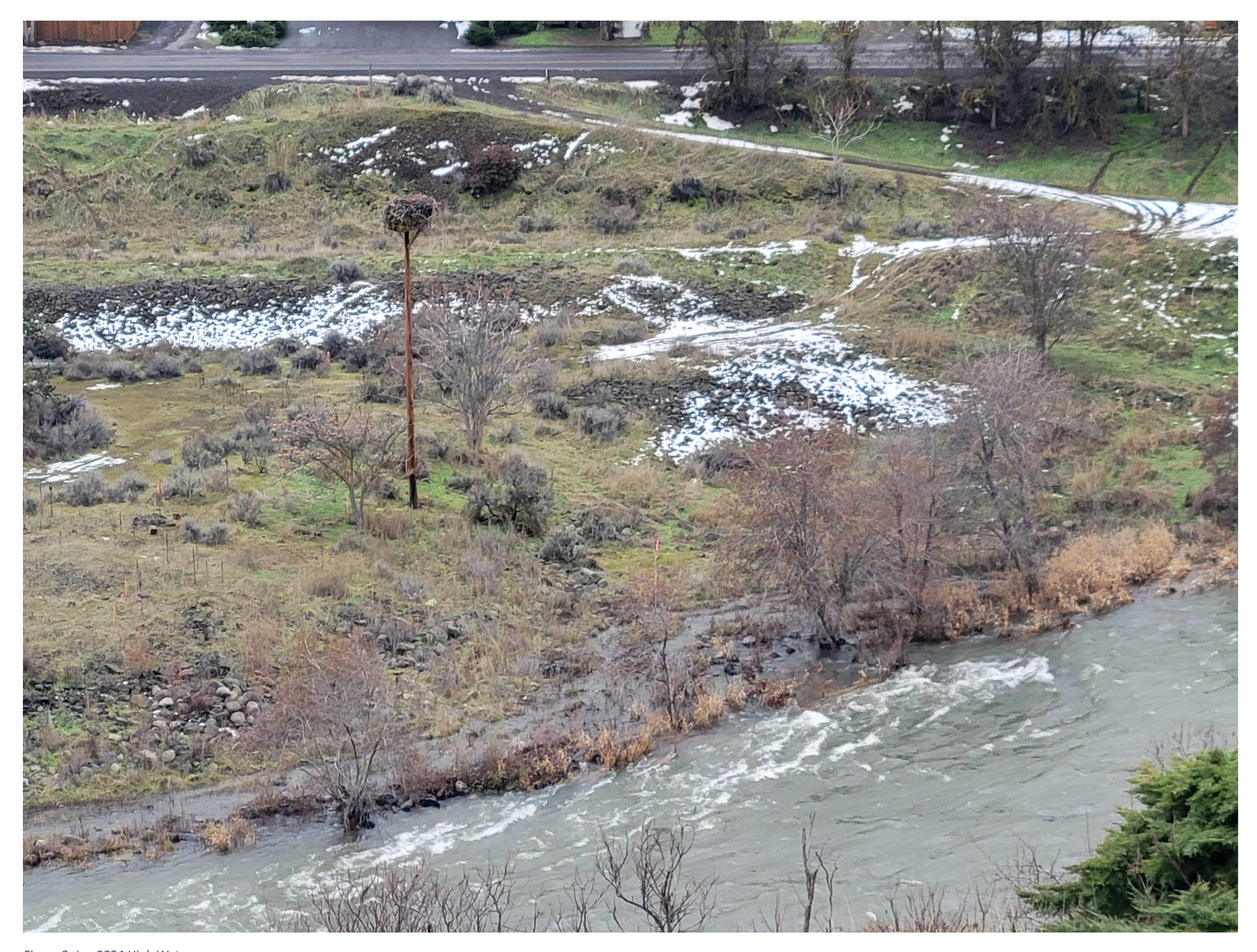
Figure 8 Jan 2024 High Water