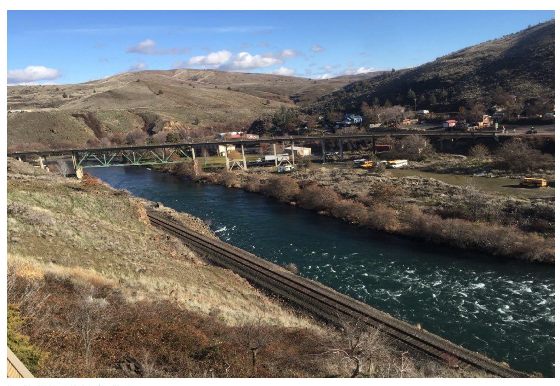
Figure 1 Jan 2021 Showing Vegetation/Trees Along River