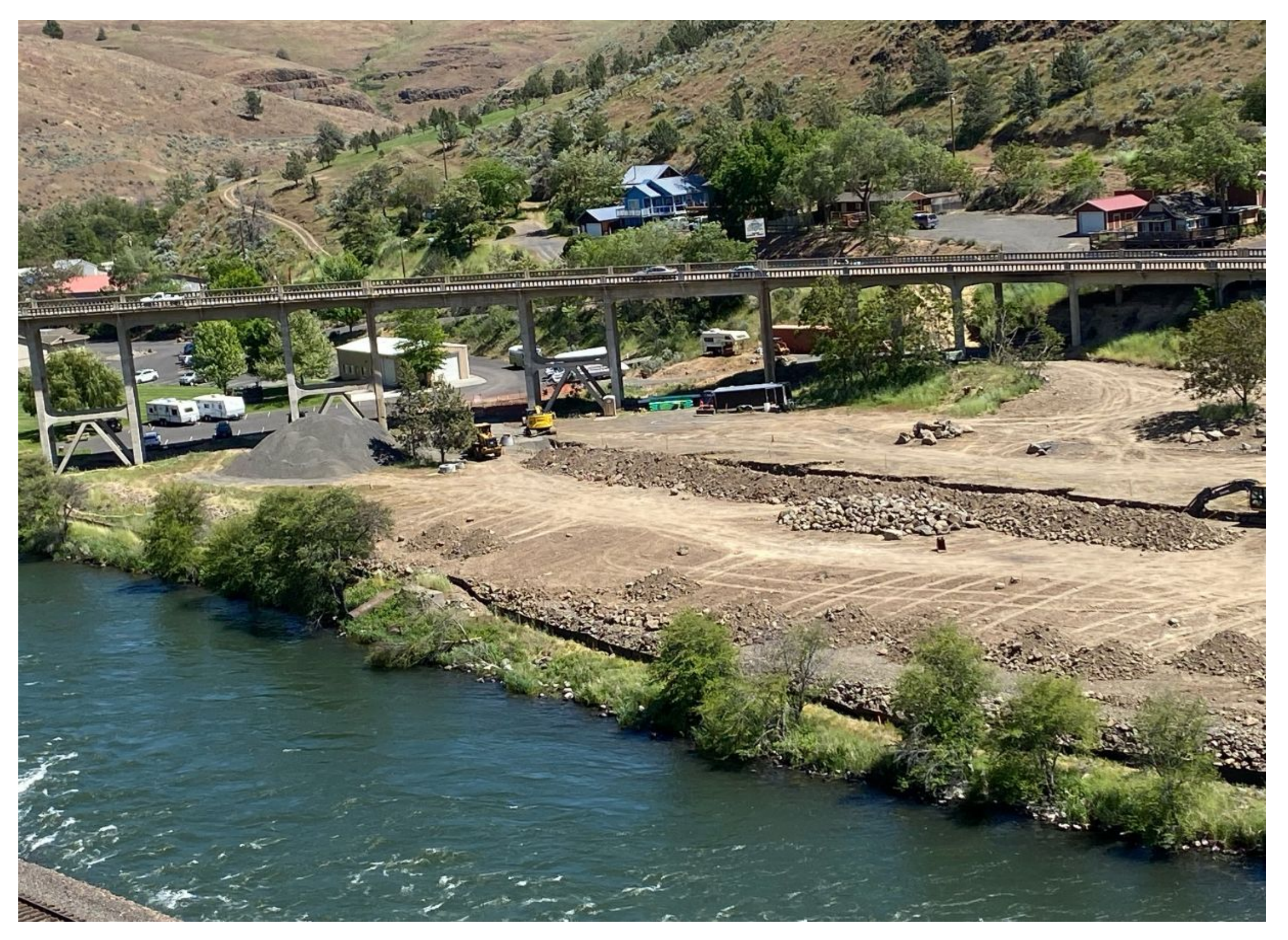
Figure 12 May 2024 During Construction