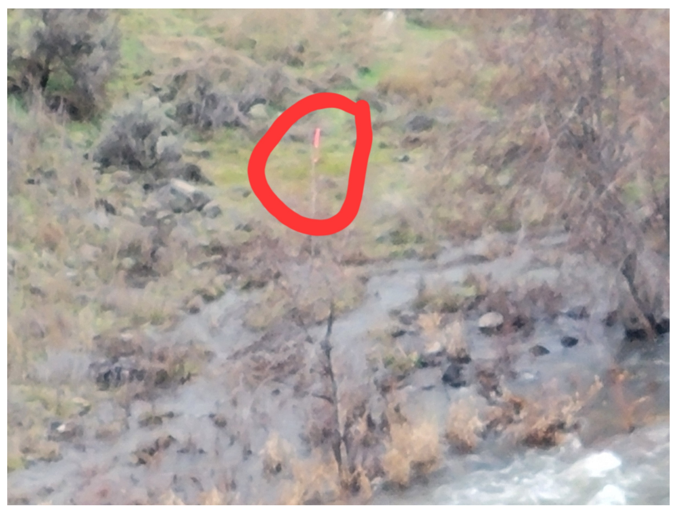
Figure 9 Jan 2024 High Water Close up of Survey Marker below old Osprey Nest