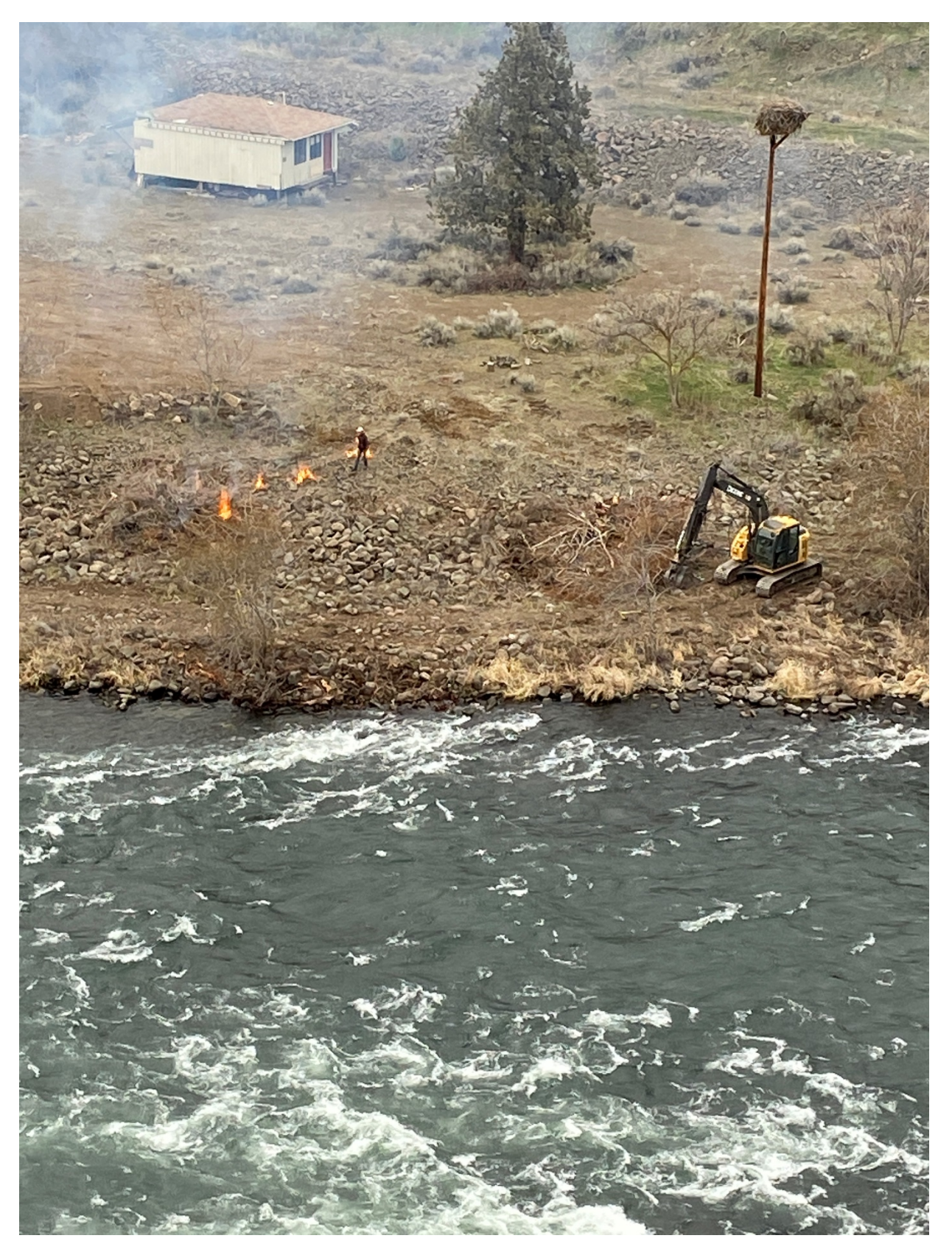
Figure 3 Feb 2022 Excavator Pulling Vegetation/Trees from River and Burning Vegetation