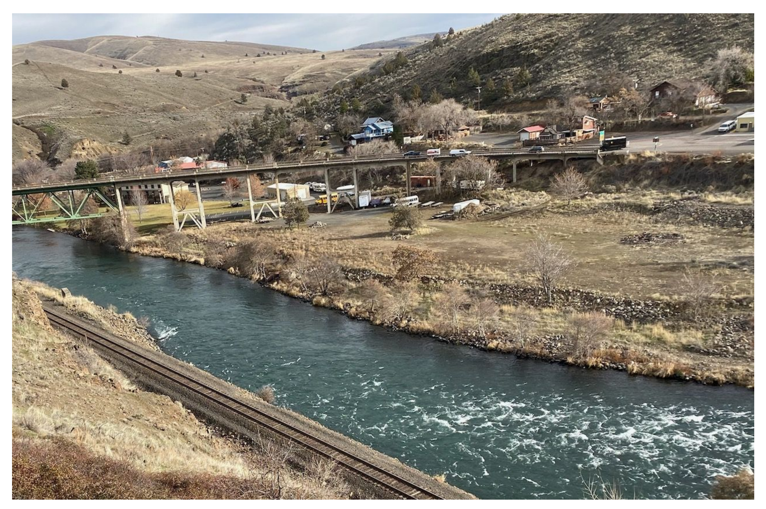
Figure 7 Feb 2023 After Removal of Vegetation/Trees From River – 1 year later