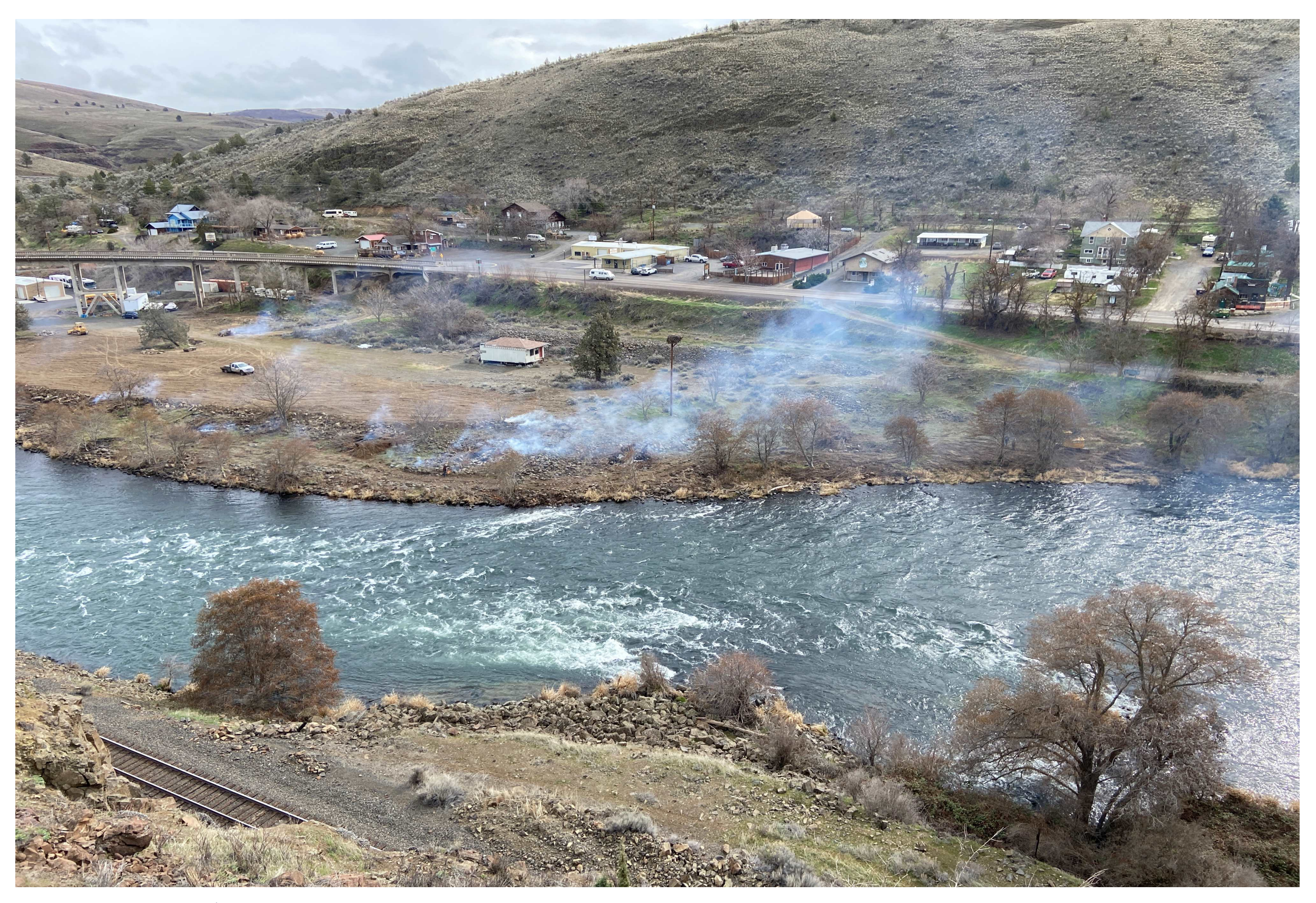
Figure 5 Feb 2022 Burning Vegetation/Trees Pulled from River – Removal of vegetation on adjacent upriver property, owned by McLucas Family