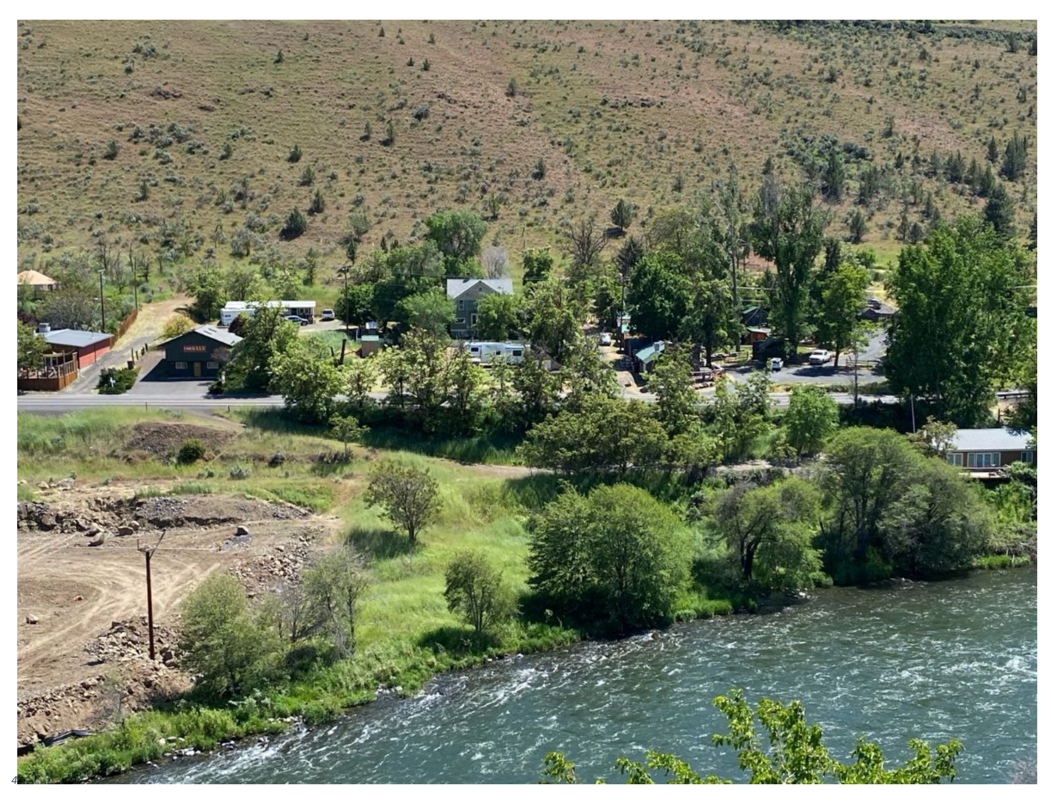
Figure 11 May 2024 During Construction – After Osprey nest removed – New nest installed closer to river – upriver McLucas Property