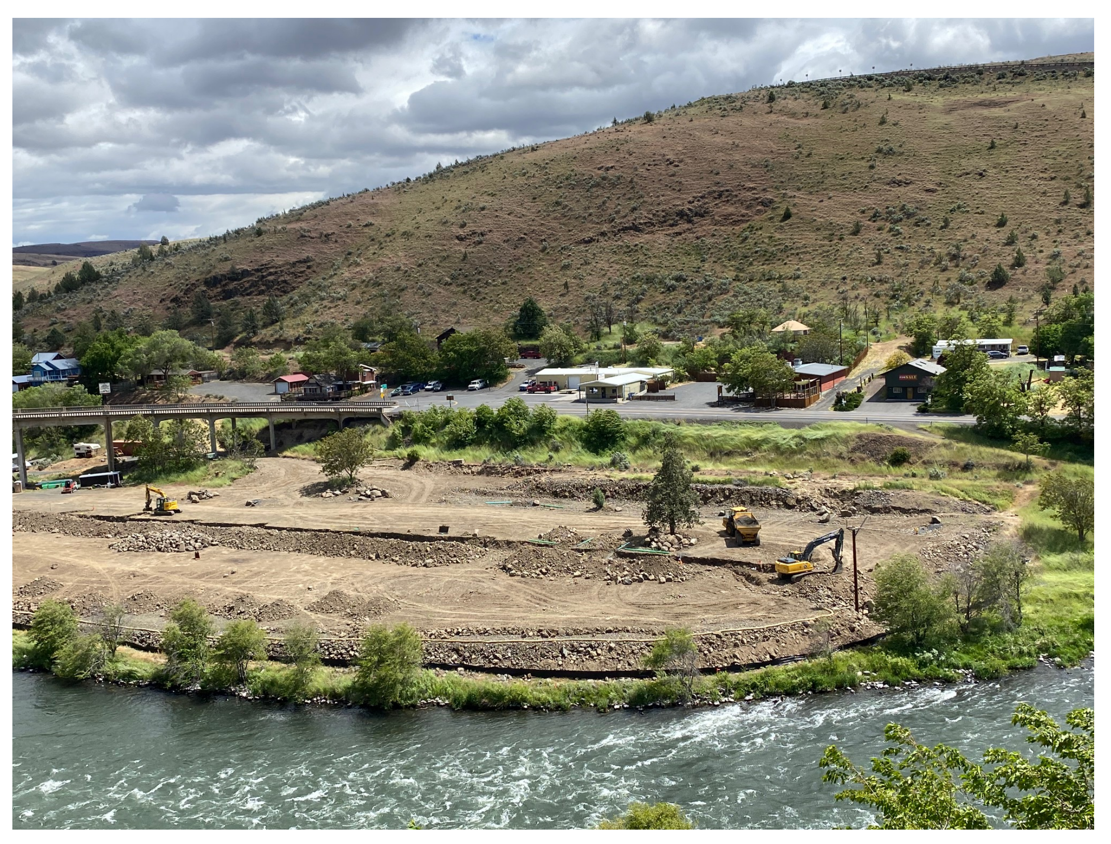
Figure 10 May 22 2024 – Old Osprey nest removed – new one installed at property marker