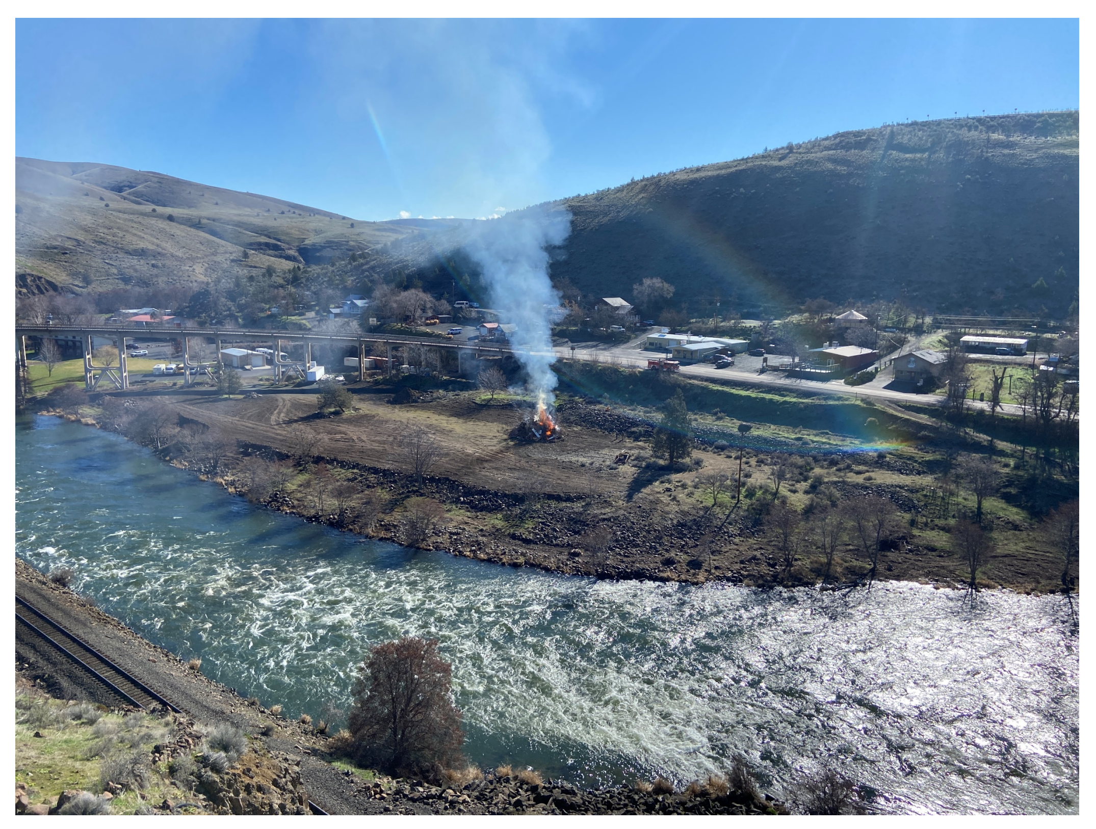
Figure 6 Feb 2022 After Vegetation/Trees Removed and Burned – Building Burning – including upriver property owned by McLucas Family, cleared of vegetation in/along river